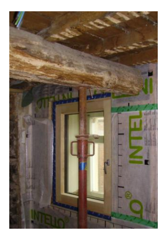
Figure 1: Case study Eupen: section of the row house in Eupen (before and after renovation, left) and detail of interior insulation, air tightness and cutting through carrier beam (right).

The project proved to be quite a challenge in complexity, trialability and compatibility. Being the first demonstration project of a renovation towards the passive house standard in Belgium, the owner had to find all the technological solutions at regional level. In the design stage, extra care had to be taken with the evaluation and solution of thermal bridges. The city did not grant a permit to insulate the façade on the street side, so a solution for interior insulation on the front façade needed careful study and development. Providing building air tightness was a challenge, as was careful dimensioning and control of the ventilation system.