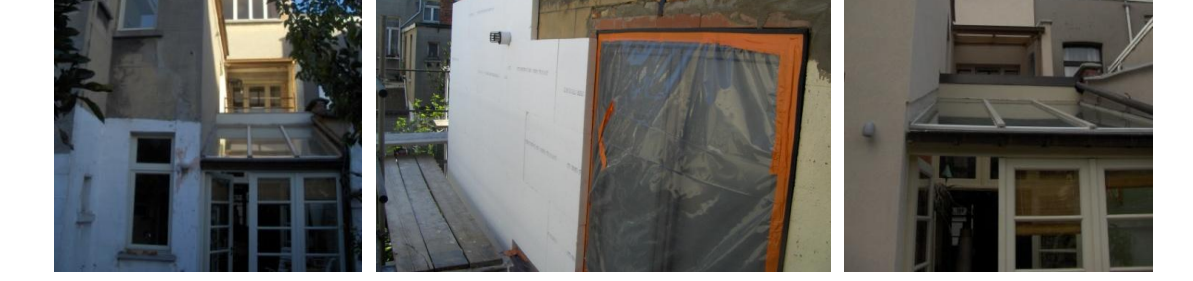
Figure 2: Case study Antwerp: detail of rear insulation (first, intermediate and final steps). Source: PHP, arch. G. Camerlinck; Photo: E. Mlecnik